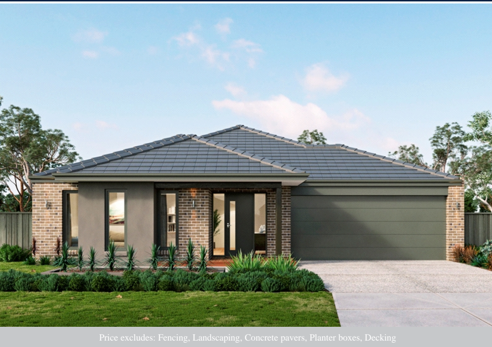
Price excludes: Fencing, Landscaping, Concrete pavers, Planter boxes, Decking